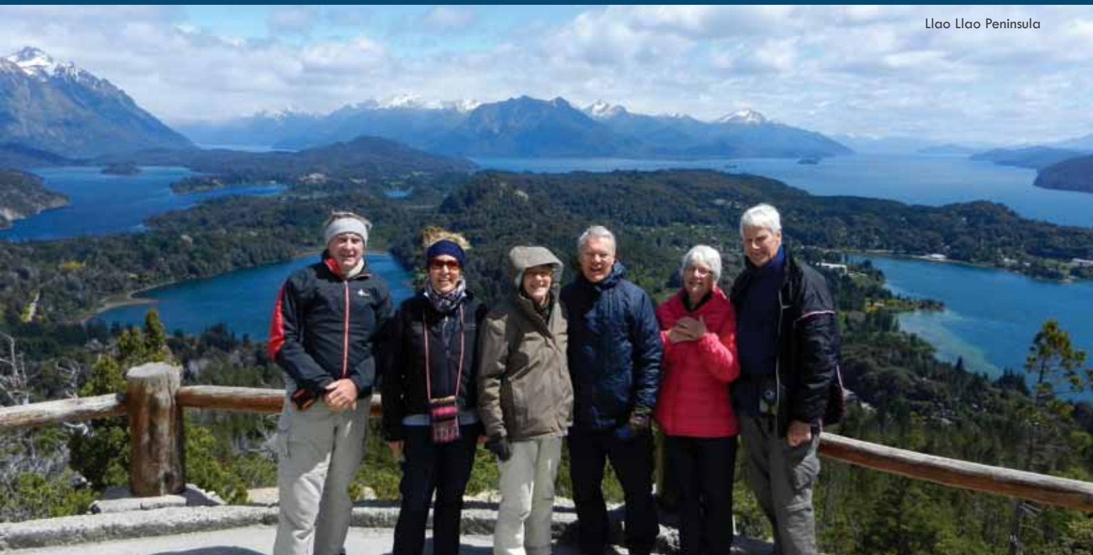
Llao Llao Peninsula

Day 22 Fri Rio de Janeiro/ Iguazu Falls Fly to Iguazu Falls, and tour the Brazilian side for jaw-dropping panoramic views. B