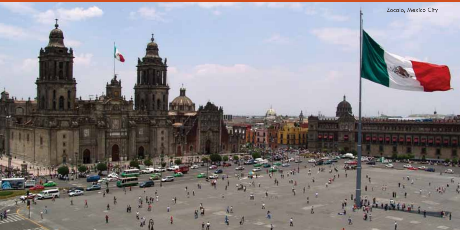
Zocalo, Mexico City