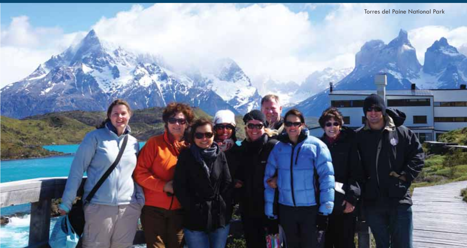
Torres del Paine National Park

Day 24 Sun Iguazu Falls/ Buenos Aires Fly to Buenos Aires. Afternoon at leisure. B